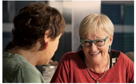
The Always Someone There programme was consolidated in 2019.

This 2019 also served to consolidate the Always Someone There programme, which addresses a growing challenge: to tackle situations of loneliness from the perspective of each person's abilities and the construction of community support and care networks. Always Someone There is jointly conducted with public administrations and more than 110 entities in Tortosa, Girona, Tàrraga, Santa Coloma de Gramenet, Palma, Logroño, Jerez de la Frontera and Lleida. More than 600 people have benefited from this programme. —