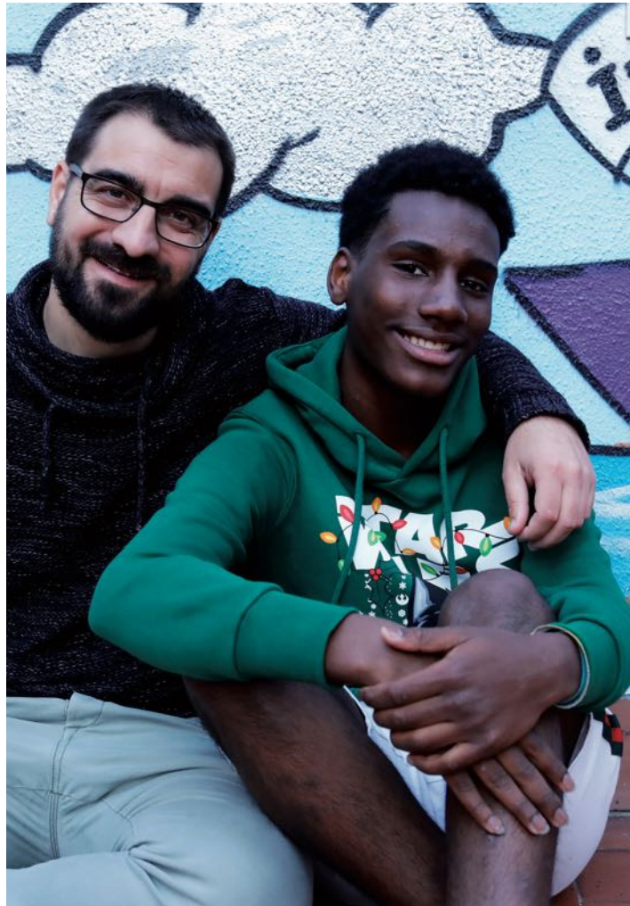
The programme coordinates strategies of social participation and intercultural coexistence.

It builds strategies for social participation and intercultural coexistence, primarily in families, children and young people, in collaboration with major social agents. In the intervention territories as a whole, it has achieved the active involvement of 55.9% of the main institutional, civil and technical/professional agents in the many community coordination and organisation activities and spaces created.