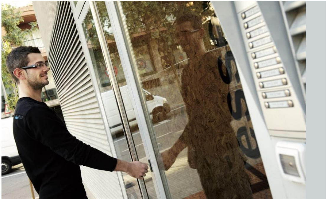
"la Caixa" Foundation has two programmes for access to housing for people on low incomes.

are in a vulnerable situation. While the Affordable Housing programme of "la Caixa" also offers alternatives to ensure the emancipation of young people and dignified housing for the elderly. —