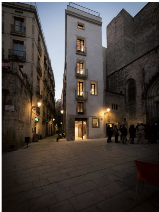
Left, the Esperanza Foundation's new building in the Gothic Quarter was opened in 2019. Right, the Casa de Recés welcomes women aged between 18 and 35 in vulnerable situations.

The Esperanza Foundation is an open-door entity that offers care and resources to people and families in situations of poverty and exclusion with the aim of promoting their autonomy, improving their quality of life and helping