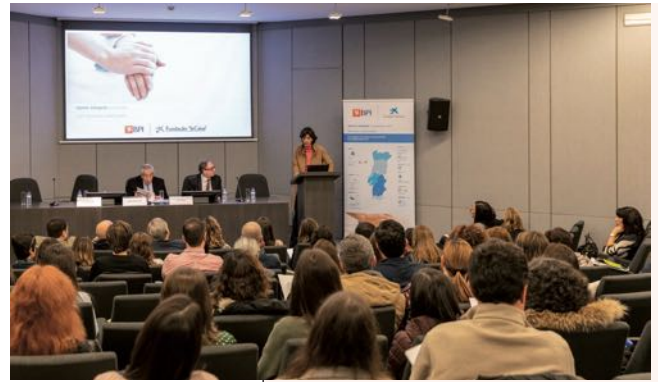
Humaniza programme session in Portugal.

"My job is to help channel all the anguish felt by the sick person at the moment of a threat of their own existence."