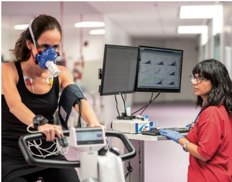
25 initiatives of scientific excellence were selected in the Call for Health Research Grants in 2019.

Finally, it should be noted that ”la Caixa” Foundation this year consolidated its collaboration with Portugal’s Fundação para a Ciência e a Tecnologia, as well as Luzón Foundation. Both institutions this year contributed more than one million euros to help finance 3 of the 23 projects selected. —