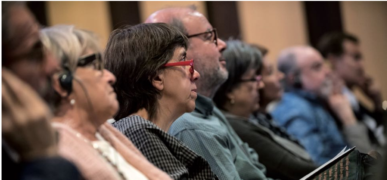
Audience members at one of the talks held at Palau Macaya.

SOCIAL INNOVATION: This block comprises a number of talks and seminars on the Reflections and Calls programmes.