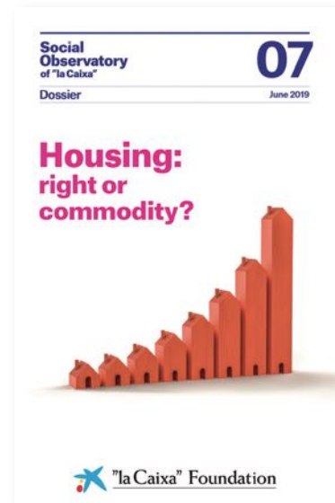
Covers of a dossier and two reports published by the ”la Caixa” Social Observatory.

Finally, the report entitled Strengthening Social Welfare: From Minimum Income to Basic Income , published by the ”la Caixa” Social Observatory, includes the analysis of a dozen experts on the social situation in Spain and the capacity of current aid and subsidies to guarantee a minimum income for all citizens in order to reduce poverty and inequality. —