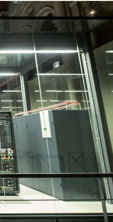
The aim of our fellowship programmes is to attract and retain research talent in Spain and Portugal.

Finally, mention must also be made of our most traditional programme: postgraduate fellowships abroad. This programme provides the finest Spanish students with access to the best universities in Europe, North America (USA and Canada) and the Asia-Pacific area (Australia, China, Singapore, Japan, India and South Korea). These fellowships have a maximum duration of two years. —