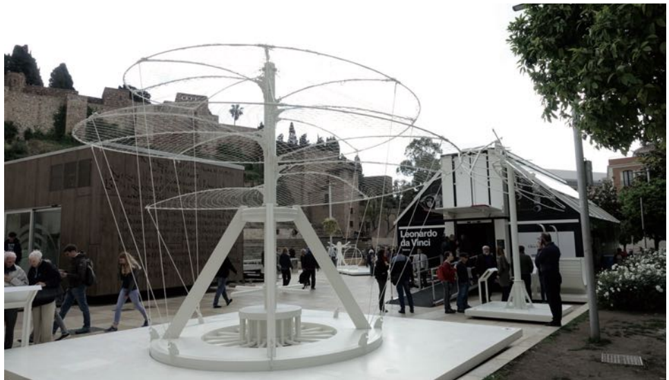
Exterior of the exhibition Leonardo: Observe, Question, Experiment.

Thanks to collaboration agreements with local administrations throughout Spain, these travelling exhibitions visit various cities and municipalities, and offer guided tours for the general public and also school groups. The wide range of exhibitions is complemented by a series of educational and social activities revolving around them, thereby helping to create a true tool for local social promotion.