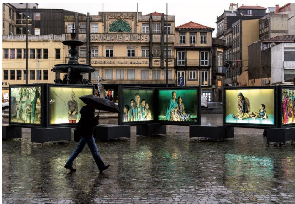
The Land of Dreams exhibition was one of the new projects for 2019.

Another two fold-out units have brought the figures of both Picasso and Georges Méliès closer to the public throughout Spain. Picasso: The Journey of Guernica is a project developed in collaboration with the Museo Nacional Centro de Arte Reina Sofía, analysing the history of the famous painting. At the same time, Let the Show Begin: