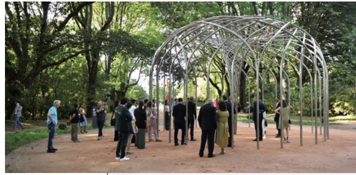
Olafur Eliasson exhibition at the Serralves Foundation in Porto.