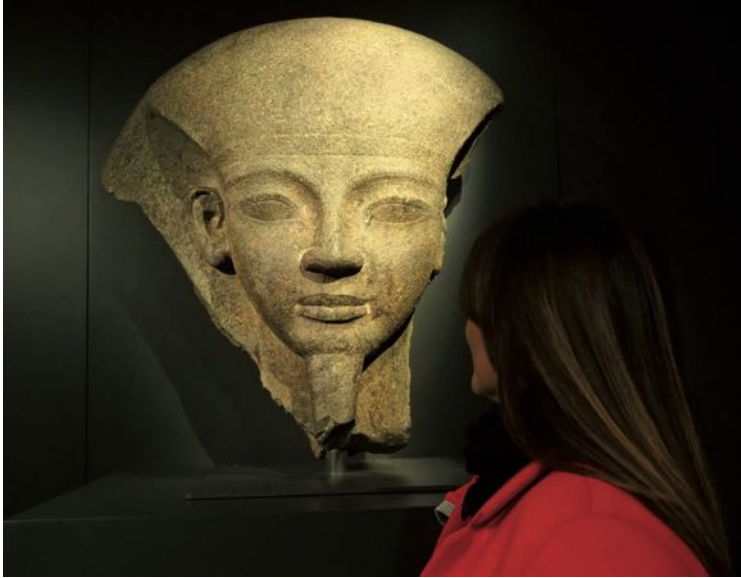
A visitor viewing a piece on display in the exhibition Pharaoh: King of Egypt .