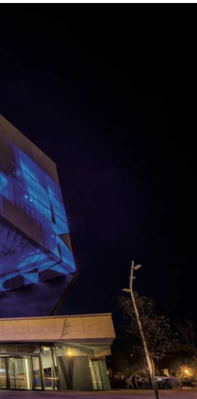
The spectacular CaixaForum Zaragoza building is located in the city's so-called "Digital Mile".