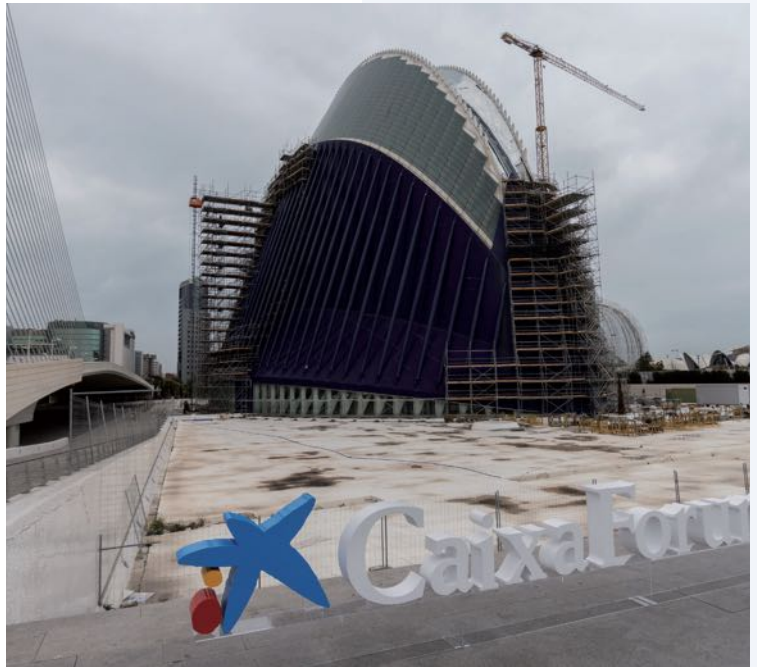
The future CaixaForum Valencia will measure 6,500 m 2 .