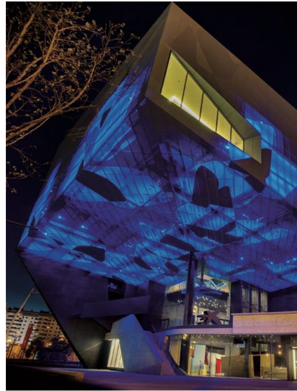
The exhibition Agon! Competition in Ancient Greece at CaixaForum Palma.

Families also discovered another way of experiencing CaixaForum in the form of its daily programme of different activities, adding a quality plus to leisure time.