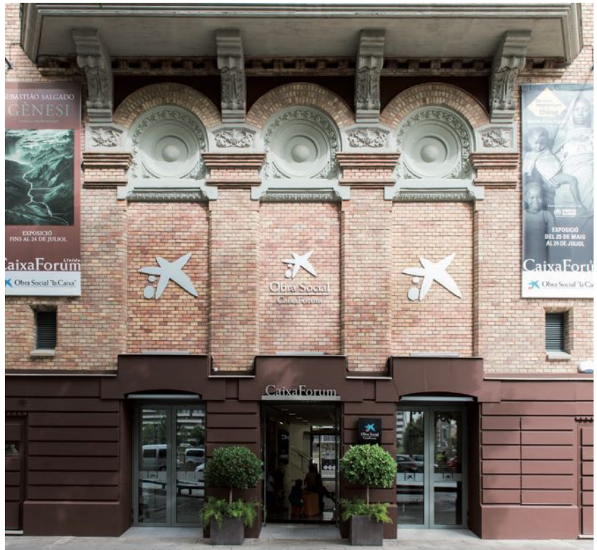
CaixaForum Lleida commemorated the 100th anniversary of its building, filled with Art Nouveau details.