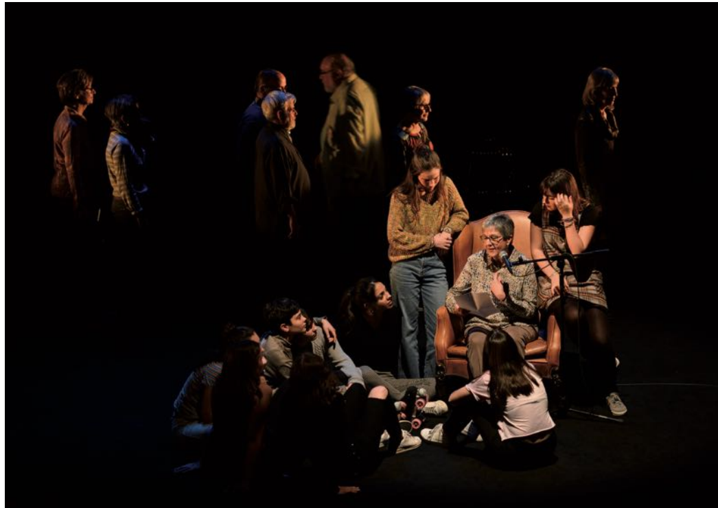
Same Day, Same Time, Same Place show by “la Caixa” Art for Change.

“la Caixa” Foundation views artistic action as a driver of social change